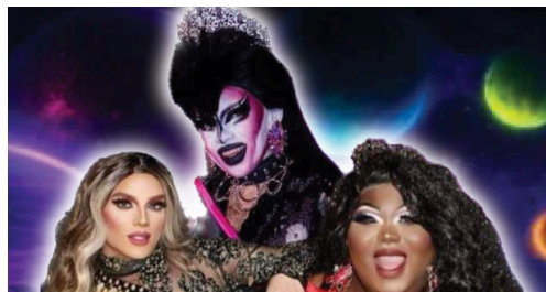
CAPITOL THEATRE DRAG ARENA ALL STARS