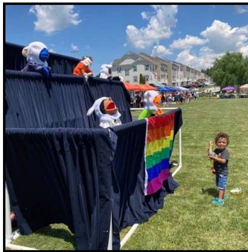
St. Matthew Lutheran Church Hanover, PA Mini Ministers Puppet Ministry, performing at Hanover Pride Fest